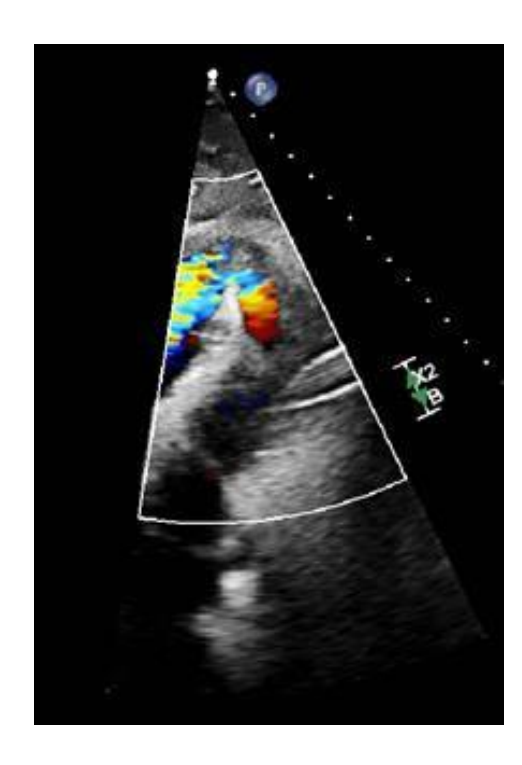
Figure 1 :Transthoracic ECHO demonstrating VSD