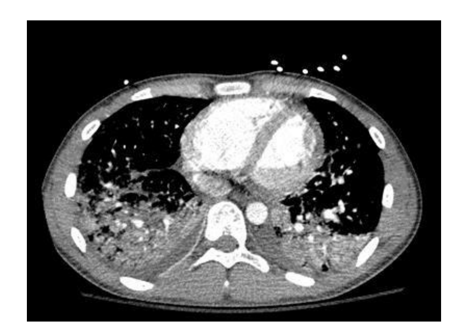
Figure 3: CTA of the chest demonstrating evidence of right ventricular enlargement espectally when compared to patients first CT of the chest.