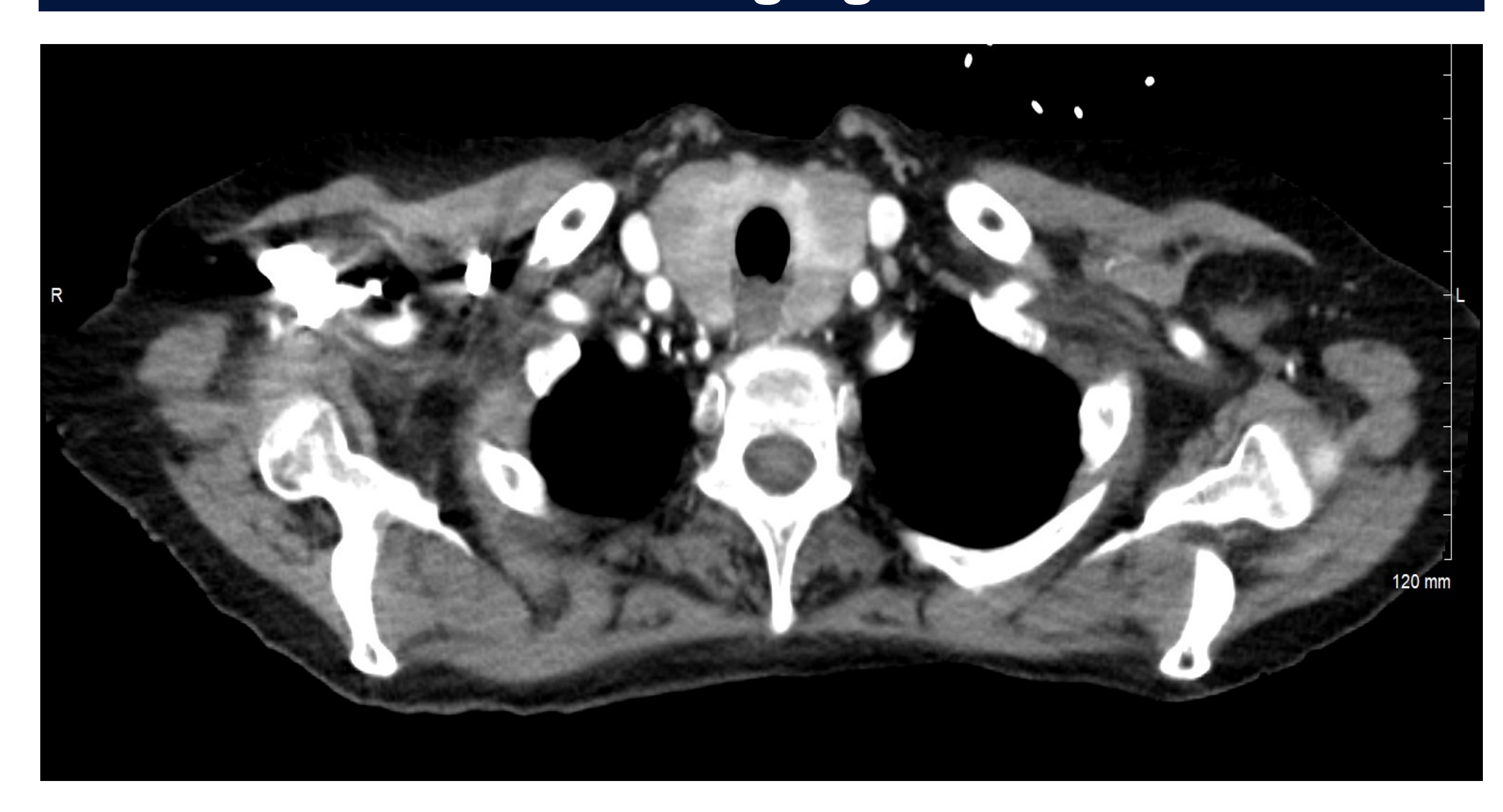
• Figure 1: CT of the chest with contrast demonstrates an enlarged and heterogenous thyroid gland.